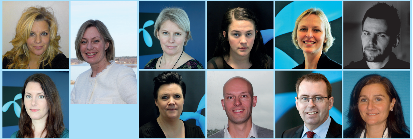
Telenors ECPAT-team 2012