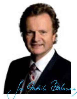
Jon Fredrik Baksaas President and CEO

Telenor will continue to develop customer friendly and innovative solutions. In all our markets we maintain our focus on sustainability to ensure positive local impact.”